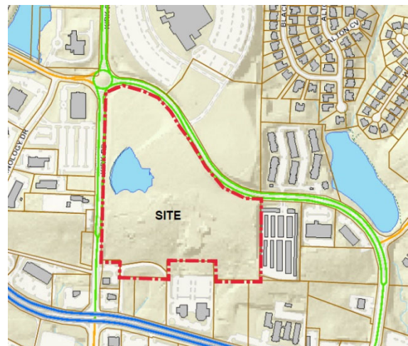
Figure 3. Master Street Plan

The site is bound to the west with Kirk Road and to the north by Wellington Hills Road – both of which are designated as Minor Arterials. Minor Arterials provide connections to and through an urban area. Their primary function is to provide short distance travel within the urbanized area. Generally these roads are spaced at one mile intervals and have a right-of-way of 90 feet. Since a Minor Arterial is a high volume road, a minimum of 4 travel lanes is required. This street may require dedication of right-of-way and may require street improvements for entrances and exits to the site.